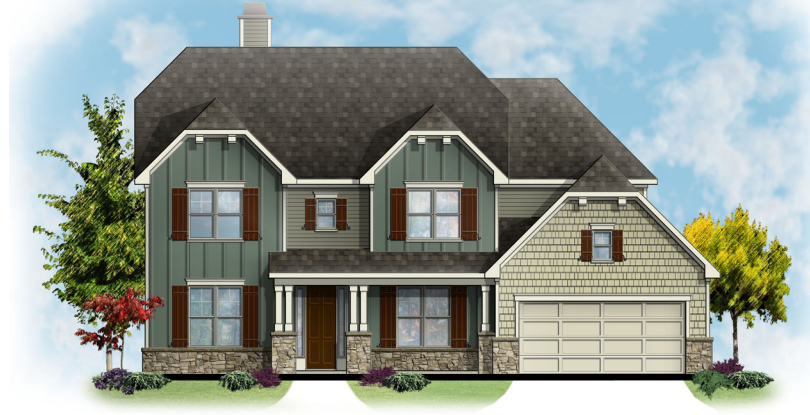
Front Elevation Barrett Heights Plan '5C'