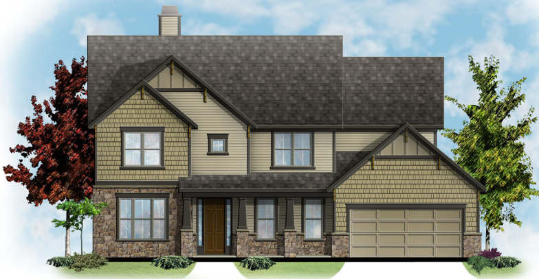
Front Elevation Barrett Heights Plan '5B'