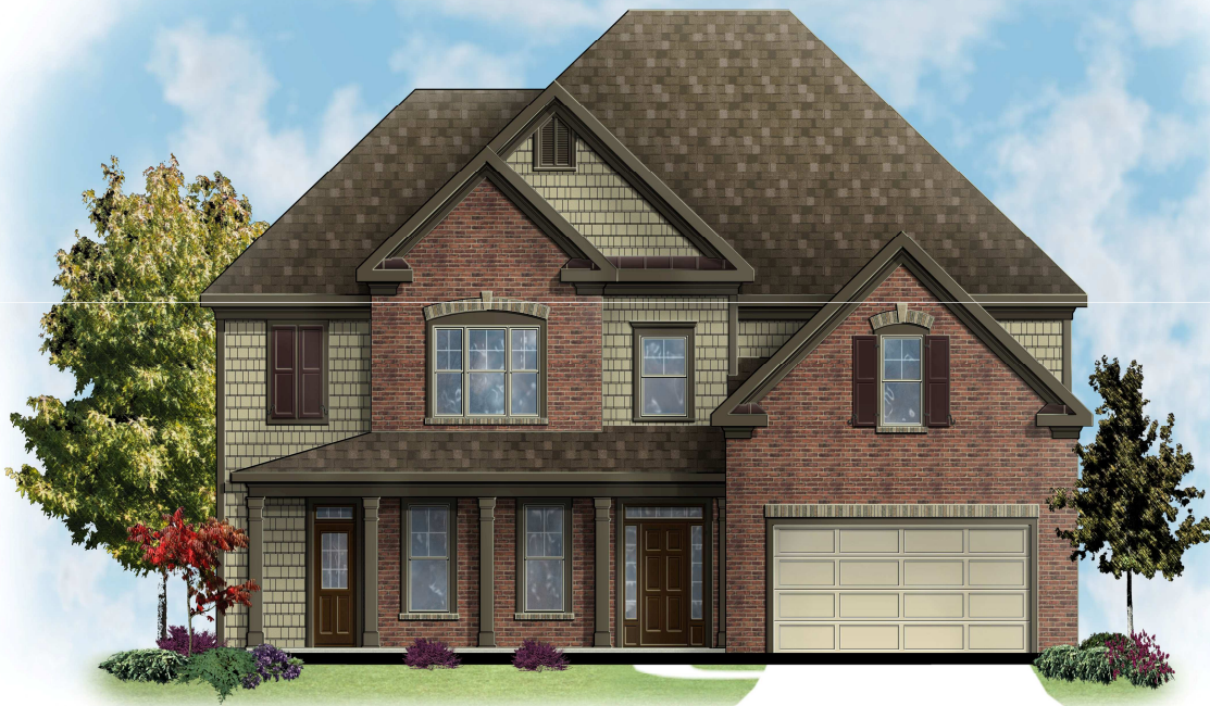
Front Elevation Ballard