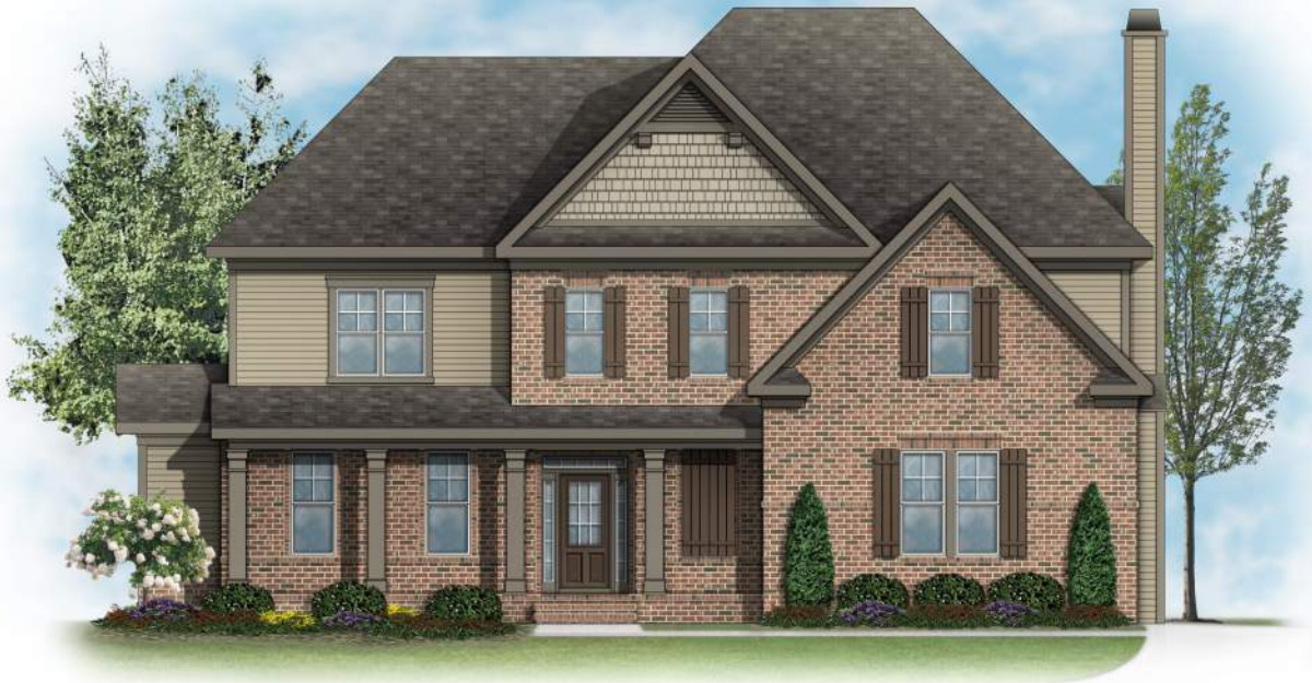
Sutter's Pond The Hannah - Elevation 'C'

RELAXED LIFESTYLE WELCOMING NEIGHBORHOODS