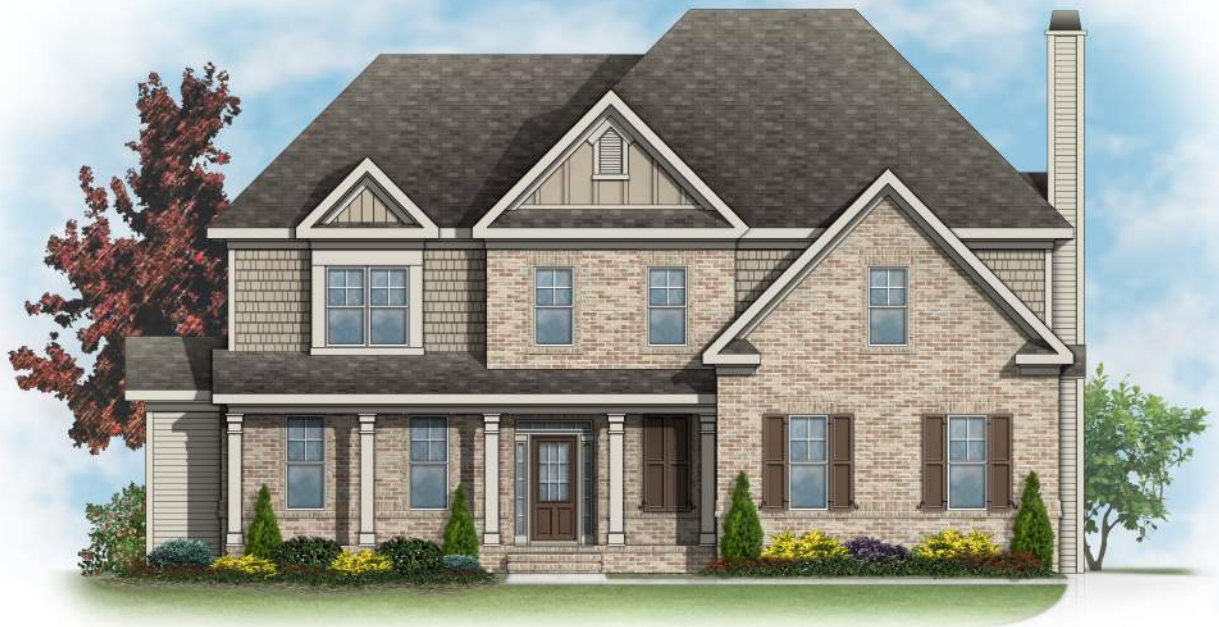
Sutter's Pond The Hannah - Elevation 'B'

RELAXED LIFESTYLE WELCOMING NEIGHBORHOODS