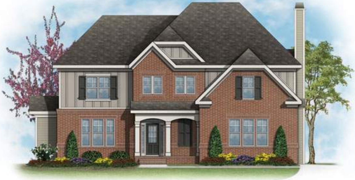
Sutter's Pond The Hannah - Elevation 'A'

RELAXED LIFESTYLE WELCOMING NEIGHBORHOODS